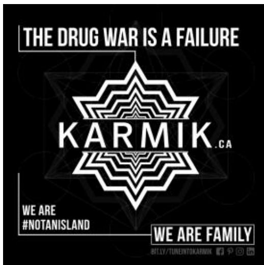
Image shows the words KARMIK inside a white lined pattern. Image also shows the word "The drug war is a failure" and "We are #notanisland" and "We are family."

PRIDE and Karmik-what an absolutely perfect combination! Both of our organizations are committed to ensuring and nurturing the safety and well-being of our communities. That's why we're incredibly excited to announce an official collaboration between Karmik and Vancouver PRIDE Society.